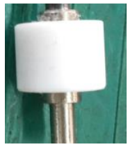
feeding paper wheel