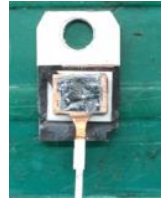
thermostatic head chip