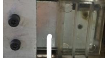
Iron Knife cutter