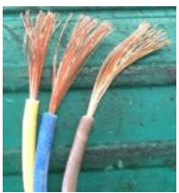
0.75 power line