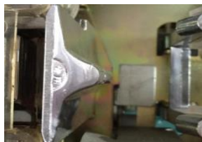
Money holder iron board